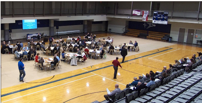
"Walking Through the Bible", an adult Sunday School Class meeting in the new gym. In 2018, Trinity's commitment continues to be "an urgent mission to reach the tens of thousands for Christ, making them disciples who WORSHIP - GROW - SERVE - GO.