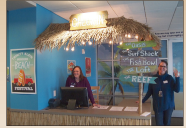
These enthusiastic ladies assist parents with checking in their children.

Texas CEF serving Congregations since 1888